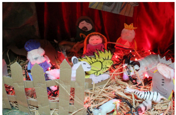
Dar al Kalima Lutheran School Kindergarten, Bethlehem