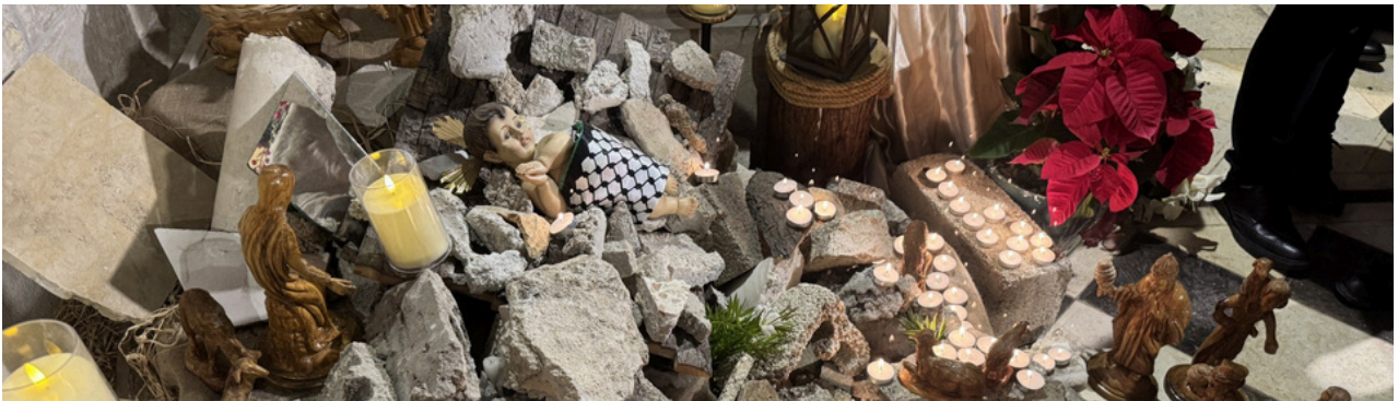
Christ in the Rubble Nativity at Christmas Lutheran Church, Bethlehem

As 2024 draws to a close, the ELCJHL is reflecting on one of the most difficult years in our 170-year history as a church. Last year the Palestinian Christian community faced a Christmas unlike any that had come before. A year later, the Holy Land marks another Christmas in mourning. After 15 months of devastating war, we are still praying for a ceasefire. We are still praying for justice and peace.