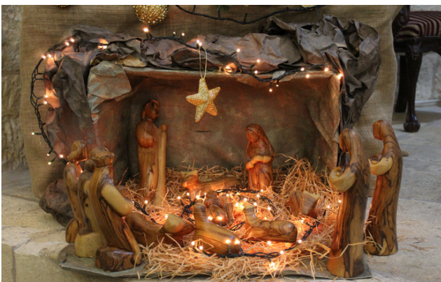
Church of the Reformation, Beit Jala